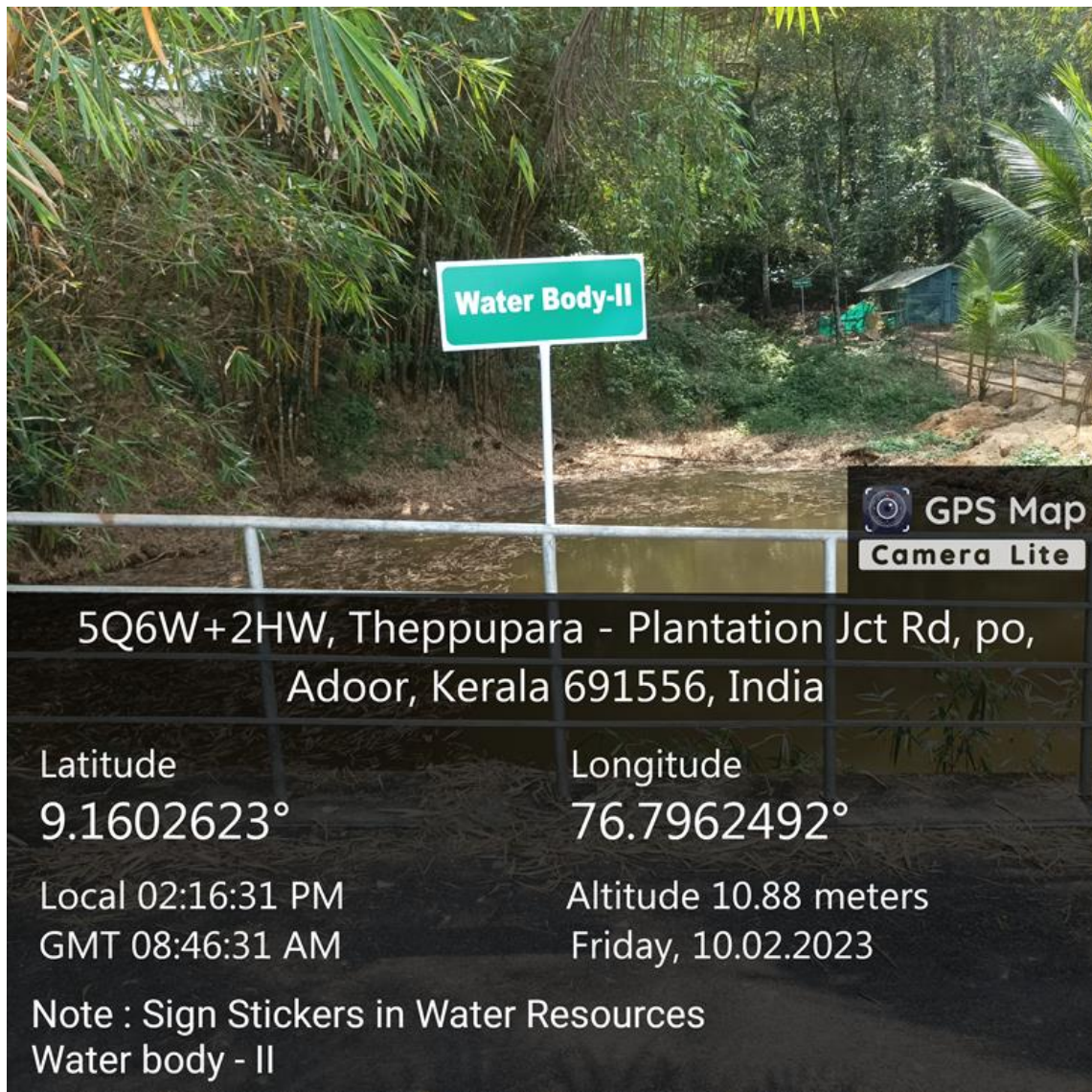
Fig 4. Sign Stickers in Water Resources, Water Body - II