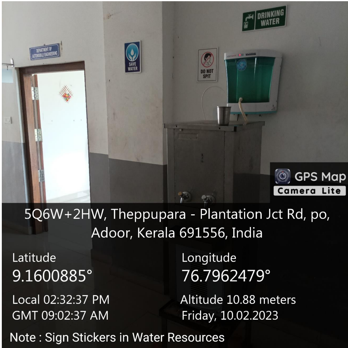
Fig 11. Water Cooler