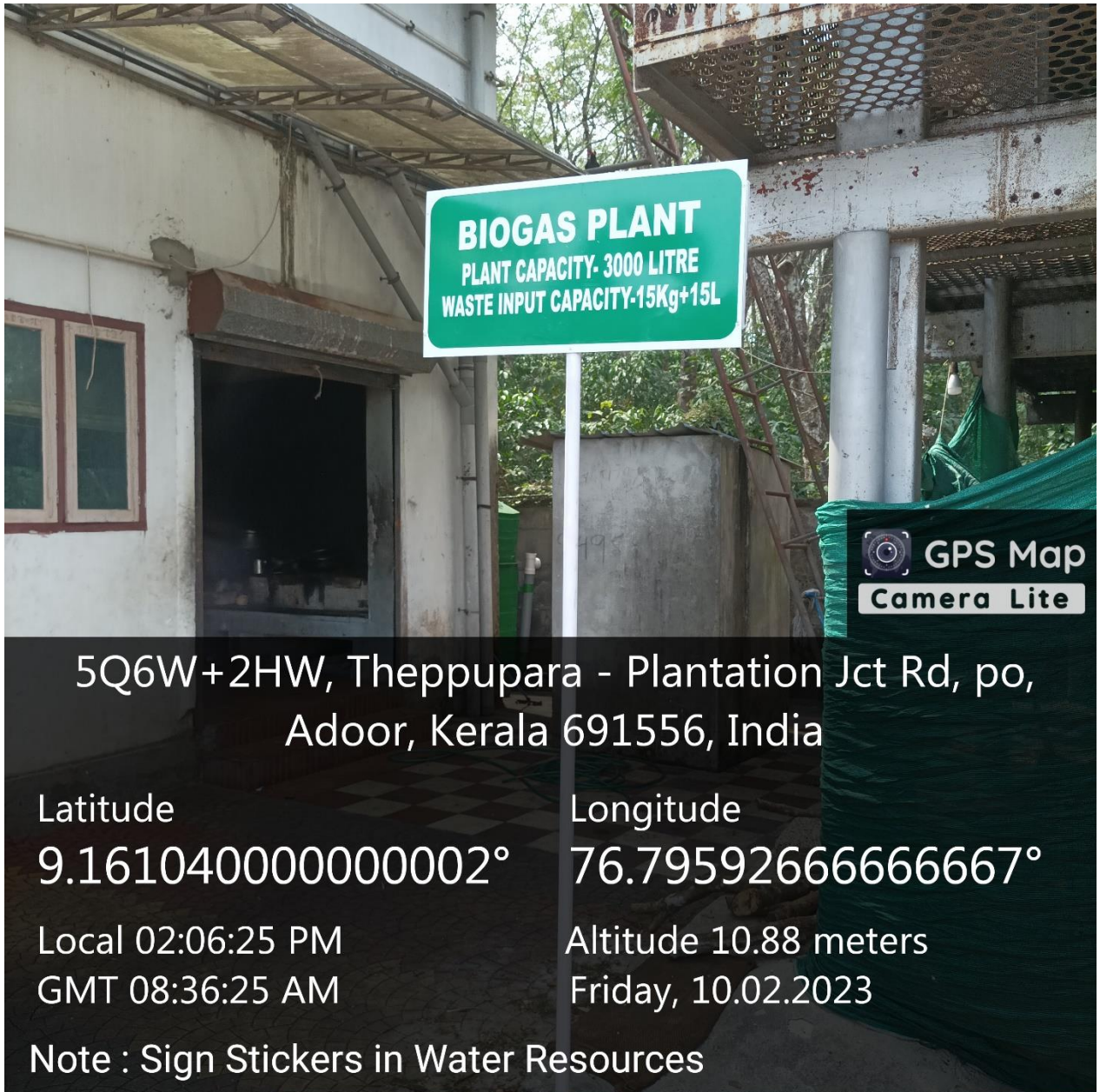
Fig 9. Sign Stickers of Bio-Gas Plant