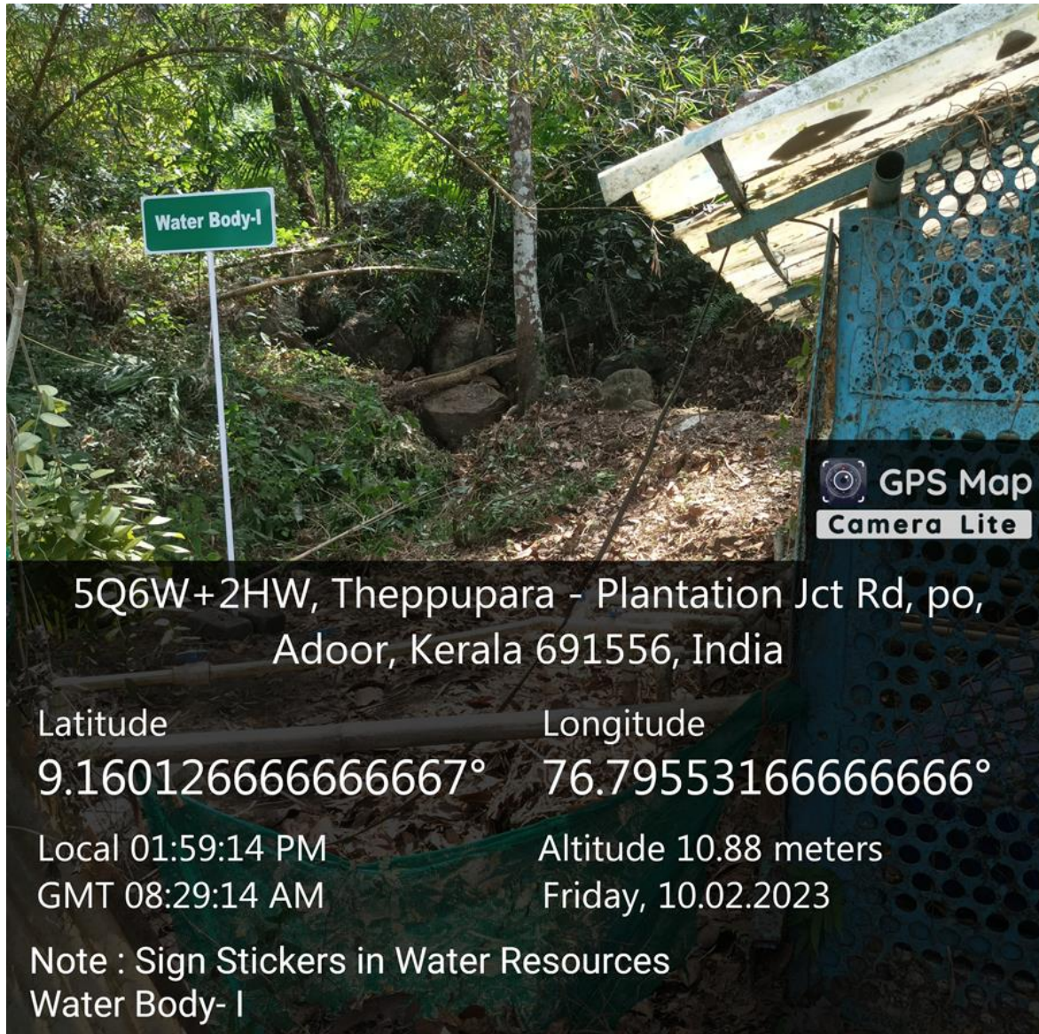
Fig 3. Sign Stickers in Water Resources, Water Body - I