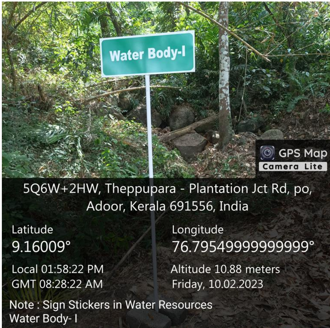
Fig 1. Sign Stickers in Water Resources, Water Body - I