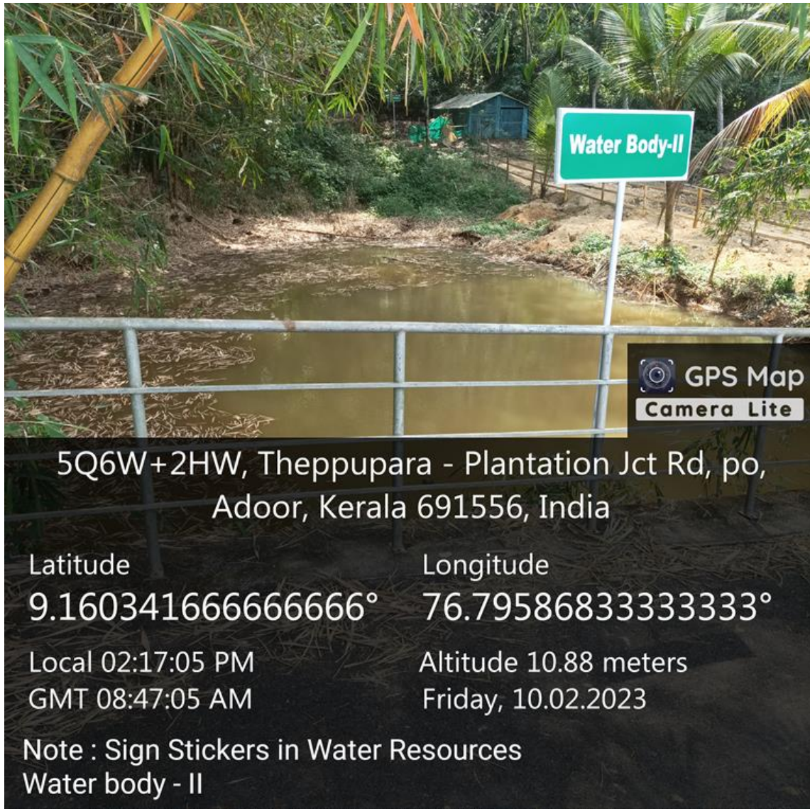
Fig 5. Sign Stickers in Water Resources, Water Body - II