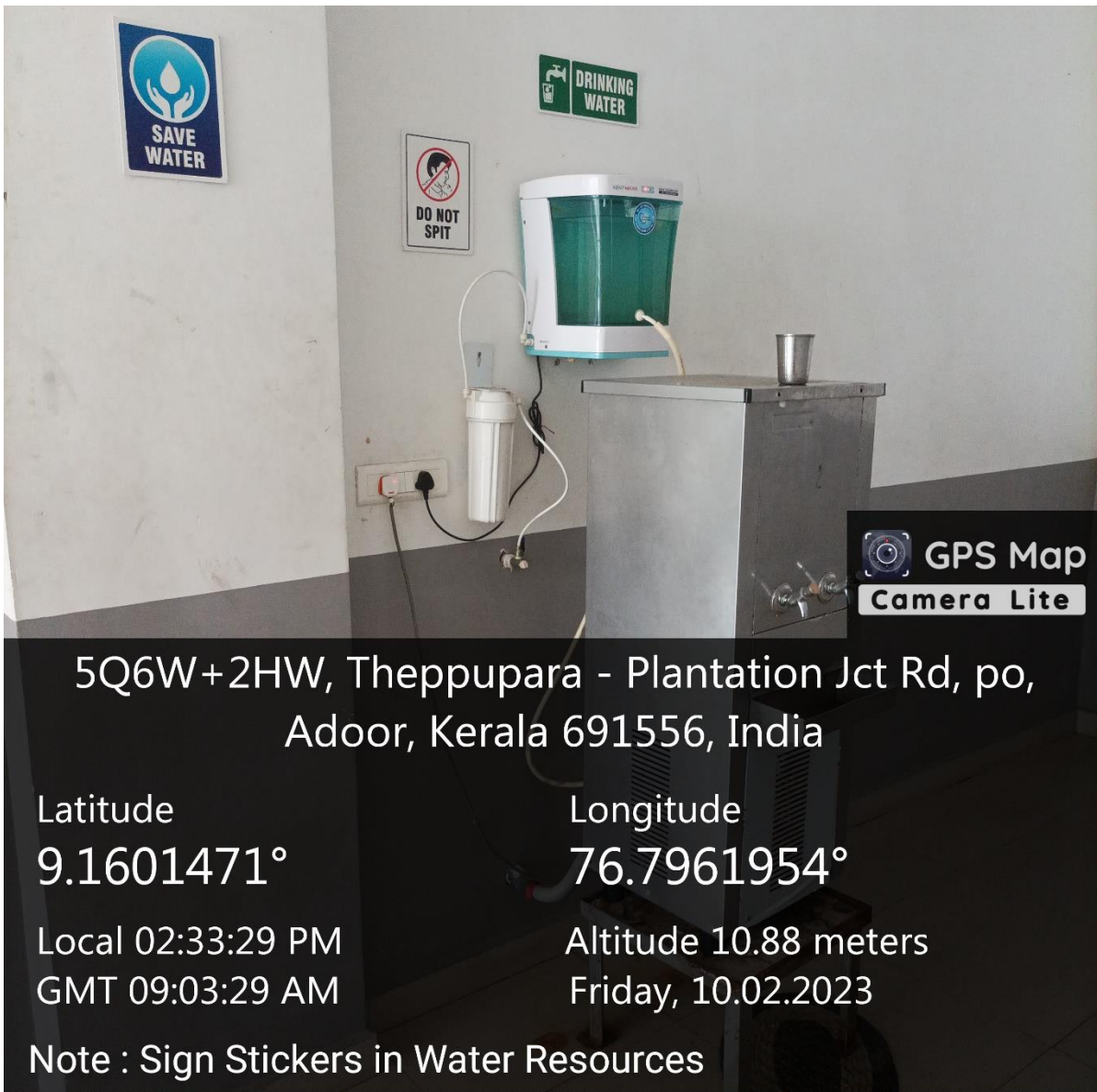
Fig 10. Water Cooler