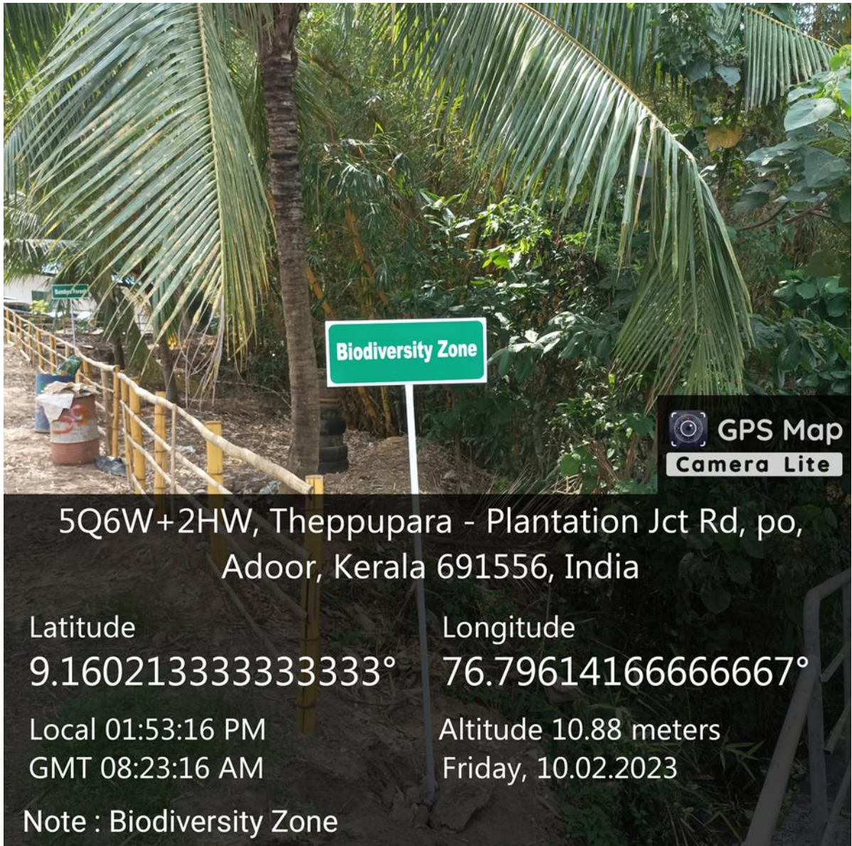
Fig 12. Bio Diversity Zone